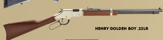
HENRY GOLDEN BOY .22LR