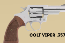
COLT VIPER .357 MAGNUM