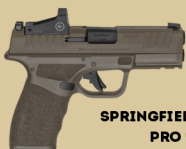
SPRINGFIELD HELLCAT PRO 9MM