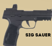
SIG SAUER P322 .22 LR