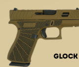
GLOCK 43X GEN3 9MM